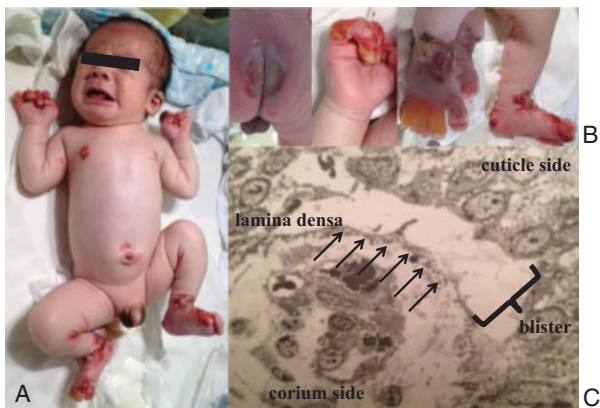
Fig. 1 Clinical presentation and electron microscopy of the patient with epidermolysis bullosa simplex. (A) Blisters at 11 days old. (B) Blistering of the buttocks, right hand, and feet. (C) Ultrastructural features of the proband’s lesional skin sample show a blister on the lamina densa. There are no apparent keratin clumps.

We found an EBS-gen intermed newborn infant with KRT5 and KRT14 gene substitutions and unaffected family members. Systemic EBS should be distinguished from other ominous diseases of neonatal blistering, including the herpes simplex virus infection. The shapes, size, and distribution of blisters as well as a positive family history are important for the diagnosis of EBS. In the present case, the clinical expressions and findings of electron microscopy showed a blister on the lamina densa without keratin clumps, which led to the diagnosis of EBS-gen intermed. 6,7