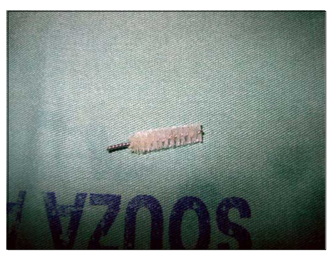
Figure 2. Bronchial foreign body (metallic brush to clean the tracheotomy canulla).