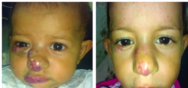
Figure 2 Multiple facial hemangiomas prior to and 6 months after treatment.

to involute resulting in a satisfactory cosmetic result in all except one case which showed an initially huge hemangioma affecting the root of the nose and medial parts of the eyelids and orbit which continued to be disfiguring and surgical resection of the residual lesion was advocated (Figure 3). On CT, the lesion appeared homogenous, showing intense enhancement with infusion during the pretreatment proliferative phase and later, with involution, it decreased in size and appeared heterogeneous, showing fibrofatty changes (Figures 4 and 5). The mean duration of treatment required was 7.67 \pm 3.96 months and the mean follow-up period after propranolol had been stopped was 5.13 \pm 3.27 months. No serious adverse effects were observed. An acceptable decrease in heart rate and blood pressure occurred in all patients within the first month (Table 1). These were considered secondary circulatory system drug effects rather than complications and did not require the cessation of therapy. Mild hyperglycemia (above 140 mg), confirmed on three occasions, was detected in one patient after 2 months of treatment and resolved by reducing the dose to 1 mg/kg/day. Peripheral vascular ischemic changes in the form of mottling, coldness, and hypoperfusion of the skin of the trunk and lower limbs occurred in another case that had no history of a vascular disease; PH was stopped and these changes