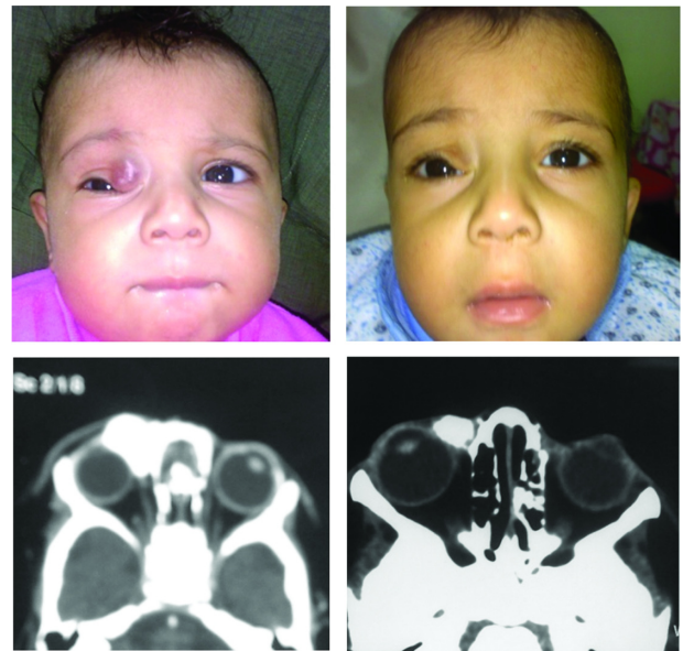
Figure 3 A right upper-lid hemangioma prior to and 3 months after propranolol hydrochloride administration with an evident decrease in size as shown by the axial computed tomography scan with enhancement.

resolved completely without sequel (Figure 5). A single case (8.3%) showed signs of regrowth after 3 months of cessation of therapy: a 12-month-old female who presented with subdermal upper-lid hemangiomas was treated with PH for 11 months. The lesion considerably decreased in size and treatment was terminated upon request of her parents.