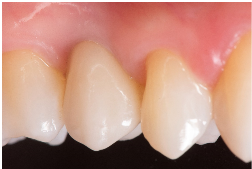
Figure 5. Final crown at 5 years follow-up.

The primary outcomes were the survival and success rates of implants and crowns. The implant survival and success-rate criteria were a modification of those suggested by Buser et al. [30]. Prosthetic success was assessed following a modification of the evaluation criteria suggested by the California Dental Association (CDA) [31].