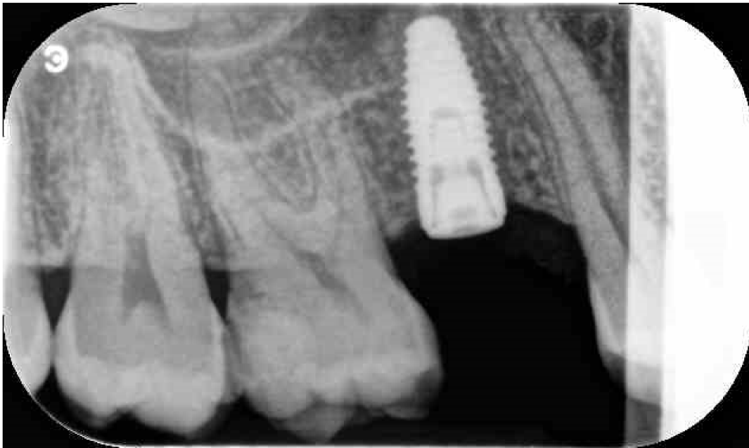
Figure 4. Periapical X-ray immediate after implant installation.