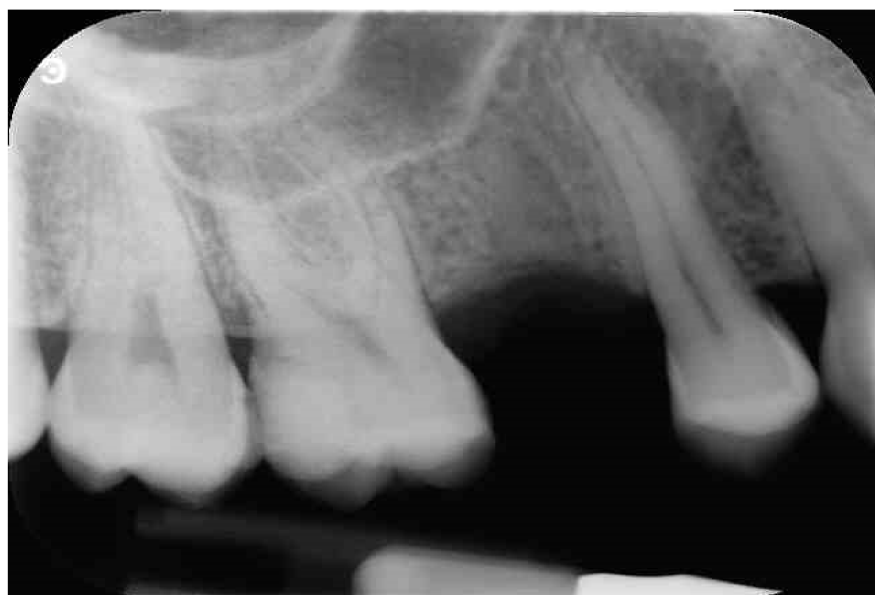
Figure 1. Preoperative periapical X-ray.