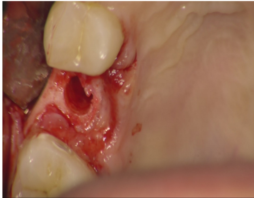
Figure 2. Recipient bed after drill preparation. Occlusal view.