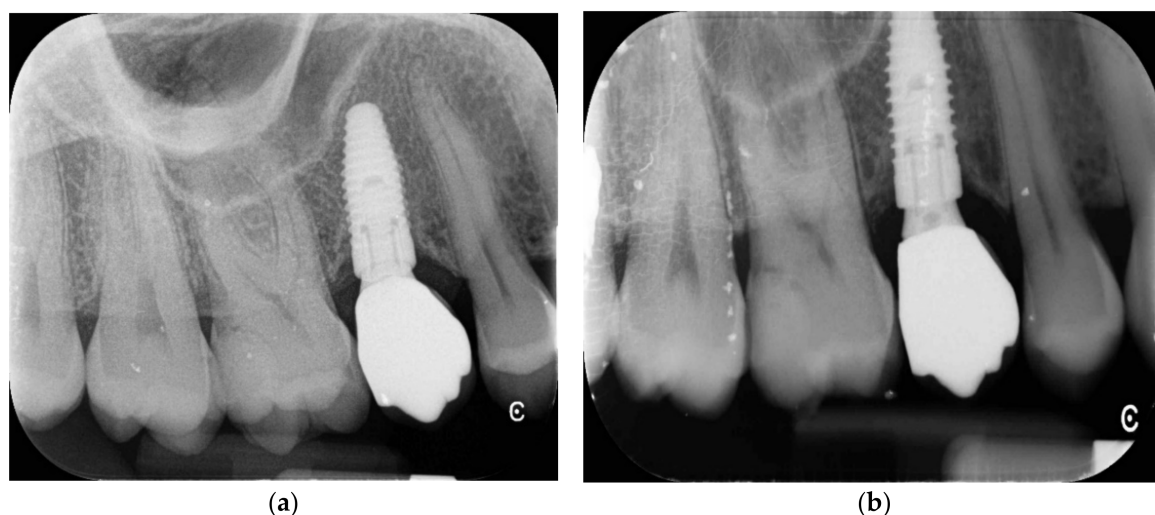
Figure 6. (a,b) Periapical X-rays at 5 years follow-up.

cone paralleling technique (Rinn XCP, Dentsply, Elgin, IL, USA) at the time of implant insertion (baseline), then 12 and 60 months after the final loading. Differences between time points were taken as marginal bone loss (MBL). All readable radiographs were viewed with an image analysis program (DFW2.8 for Windows, Soredex, Tuusula, Finland) on a 24-inch LCD screen (iMac, Apple, Cupertino, CA, USA) and evaluated under standardized conditions (SO 12646: 2004). The software was calibrated for each individual image using the known distance of the implant diameter or its length. Measurements of medial and distal bone crest levels for each implant were obtained with an approximation of 0.01 mm and reported as a mean value for each patient.