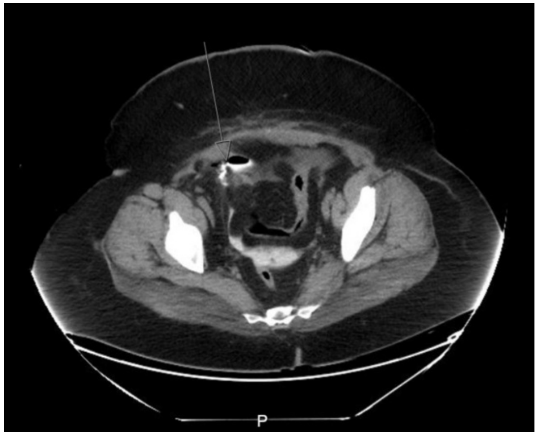
FIGURE 2: CT cystogram showing extravasated contrast within the pelvis (arrow)

A computed tomography (CT) scan of the abdomen and pelvis with contrast was performed, which revealed a small amount of subdiaphragmatic and perihepatic fluid, as well as fluid in the cul-de-sac. The urology team was consulted and a CT cystogram was performed, showing extravasated contrast material within the pelvis, with a small pocket of contrast noted along the right anterior aspect of the urinary bladder (Figure 2), likely at the site of the bladder leak. A renal ultrasound (US) showed no hydronephrosis, mild bilateral renal cortical thinning, and a small cyst in the superior left kidney.