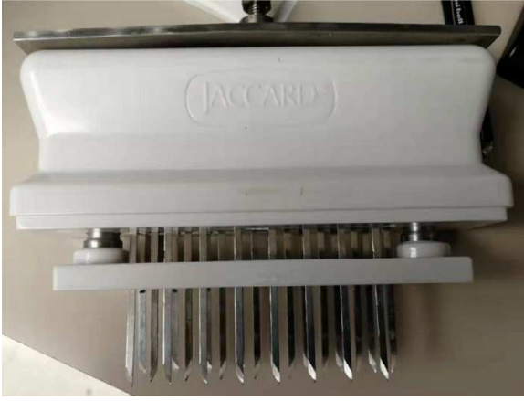
Figure 1. A multi-blade shear (MBS) probe. The multi-blade shear (MBS) probe has three rows of blades and eight blades for each row. The whole length of one row (eight blades) is 88 mm and the width between each row is 5 mm. The length and width of each blade are 4 mm and 1 mm, respectively, and the space between two blades is 8 mm.

Meat tenderizer, Jaccard Corporation New York, USA, Figure 1). The multi-blade shear (MBS) probe has three rows of blades and eight blades for each row. The length of each row with eight blades is 88 mm and the width between each row is 5mm. The length and width of each blade are 4 mm and 1 mm, respectively, and the space between each blade is 8 mm. Five BMORS and one MBS measurements were made on each fillet. The locations of the BMORS and MBS measurements were alternated as shown in Figure 2.