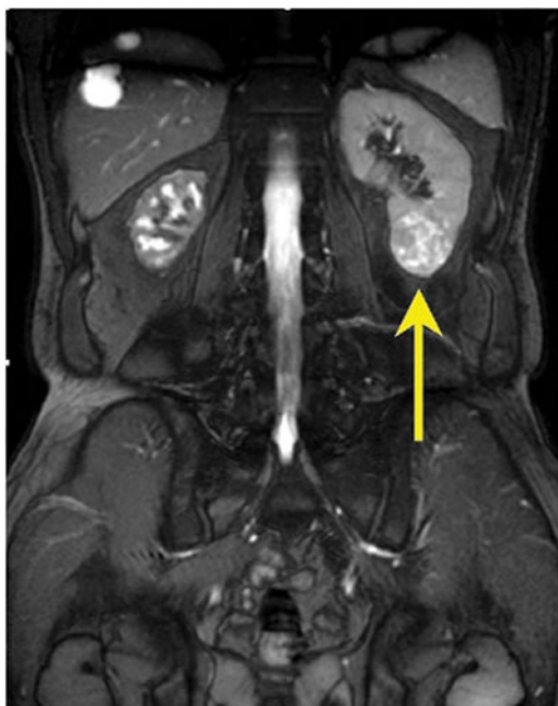
FIG. 2. A 3 cm nodular lesion over left lower pole kidney (arrow).

moderate hydronephrosis (Fig. 1). Besides, a 3 cm nodular lesion was also detected over left lower pole kidney in favor of RCC (Fig. 2). Thus, the diagnostic ureterorenoscopy was performed (Fig. 3), and a pathology report from endoscopic biopsy to right ureter tumor presented as metastatic RCC (Fig. 4). After extensive metastatic evaluations, the ureteral lesion was believed to be solitary metastasis. With the intention of preserving renal function as well as the principle of RCC management, robot-assisted left retroperitoneoscopic partial nephrectomy and right retroperitoneoscopic segmental resection of ureter and ureteroureterostomy were performed.