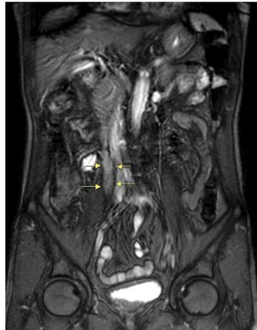
FIG. 1. A 3.5 cm nodular lesion over right upper third ureter (arrow).

A 62-year-old healthy Taiwanese man suffered from intermittent right flank pain for 1 month. He visited a local hospital at first, where intravenous pyelography revealed an obstructive lesion over right upper third ureter. He was referred to our outpatient department for further management. Impaired renal function was noted with serum creatinine (Cr) showing 1.63 mg/dL and a renal function test (glomerular filtration rate) showing diminished renal function on both sides with severely advanced on the right (left kidney: 28 mL/minute, right kidney: 6 mL/minute). Abdominal MRI revealed a 3.5 cm tumor over right upper third ureter with