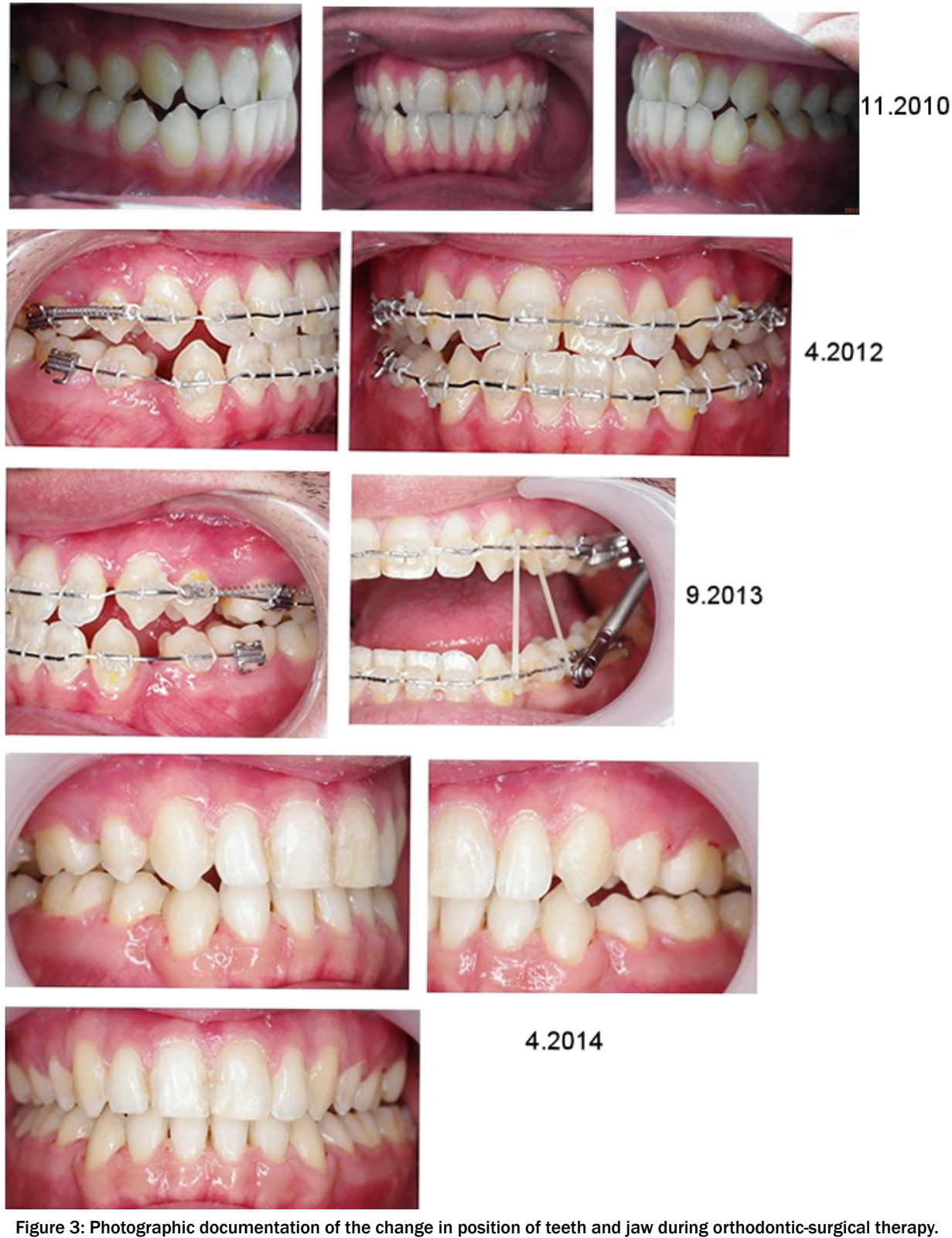
Figure 3: Photographic documentation of the change in position of teeth and jaw during orthodontic-surgical therapy. First series: View of teeth in occlusal contact from the right-front point of view (left), en face (center), and left-front point of view (right) before treatment.

Second series: View of the teeth in occlusal contact from the right-front point of view (left) and en face (right) after orthodontic treatment.