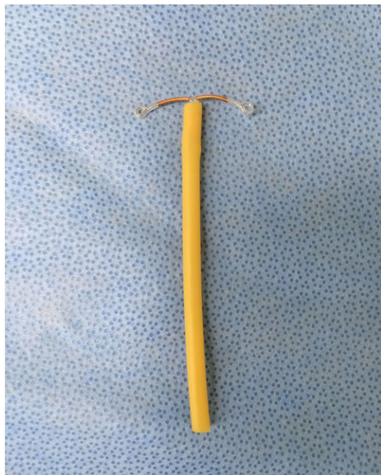
FIGURE 2 Part of 14-French Foley catheter connected with a y-shaped intrauterine device