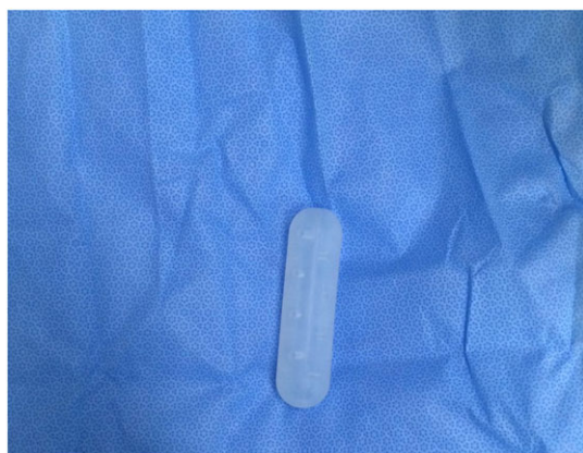
FIGURE 3 Silicone vaginal mould