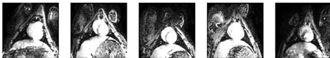
Figure 1 Effect of the signal enhancement during contrast inflow by dipyridamole-induced stress.