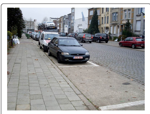
Figure 4 A sidewalk often used by careless cyclists.

from crime and therefore their walking experience. After dark participants disliked and avoided walking in abandoned streets, they liked the presence of other persons. A 75-year-old man talked about walking around in the city center during the evening: