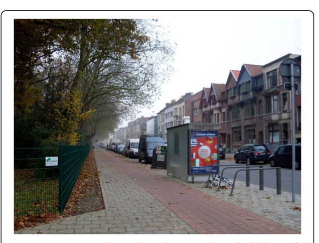
Figure 5 A street with a park on the one side and old, beautiful houses on the other side.

Next to the presence of vegetation, the presence of animals (e.g. birds, sheep, squirrels...) was considered pleasant as well.