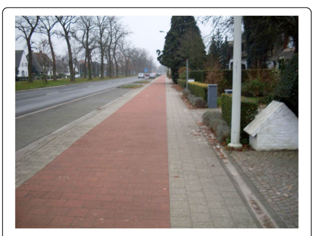
Figure 3 Red tiles clearly marking the cycling path.

Behavior of other road users Some participants expressed safety concerns related to the behaviors of other road users. Participants liked streets with slow traffic and disliked streets with speeding cars. This topic was mostly discussed near street crossings, especially when approaching cars were not visible (e.g. near sharp turns). Participants proposed solutions like speed bumps and chicanes to slow down traffic. On the other hand, participants also mentioned car drivers being very courteous and giving priority to pedestrians at crossings.