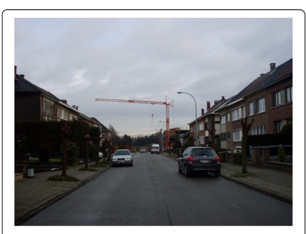
Figure 6 A street with an open view that is getting filled with buildings.

Some participants talked about weather conditions influencing their walking for transportation. Several of the previously described environmental factors are influenced by weather and seasonal conditions. Greenery was reported to be more beautiful during spring and summer because of the presence of leaves and flowers on trees and bushes. Wintertime was associated with perceived lack of safety from crime because of early darkness and with fear of falling because of icy and snowy conditions. Rainy weather was disliked by the participants because it produces puddles on sidewalks and mud on shoulders and field tracks. However, few participants (8.8%) also