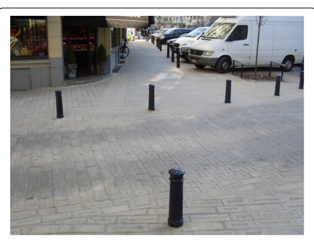
Figure 2 An even sidewalk with bollards separating it from traffic.

neighborhoods and cul-de-sacs, because they are safer and less noisy. In this respect, participants also complained about car drivers using shortcuts causing traffic to be busy in small and normally quiet streets.