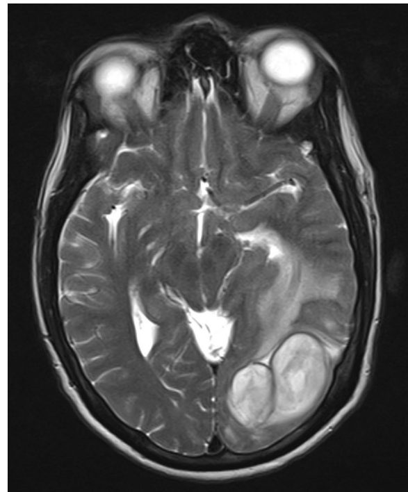
Fig. 1 Brain MRI. MRI scan of the brain showing two closely related cerebral abscesses in the left occipital region and resulting perilesional edema and the mid-line shift

Nocardiosis is a rare infection, which predominately affects lungs, brain, or the skin, and is an infection of the immunosuppressed host [5]. Lung is the primary focus,