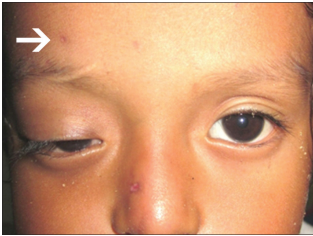
Figure 1: Right eye proptosis, ptosis, and healed hyperpigmented lesions involving the right side of face