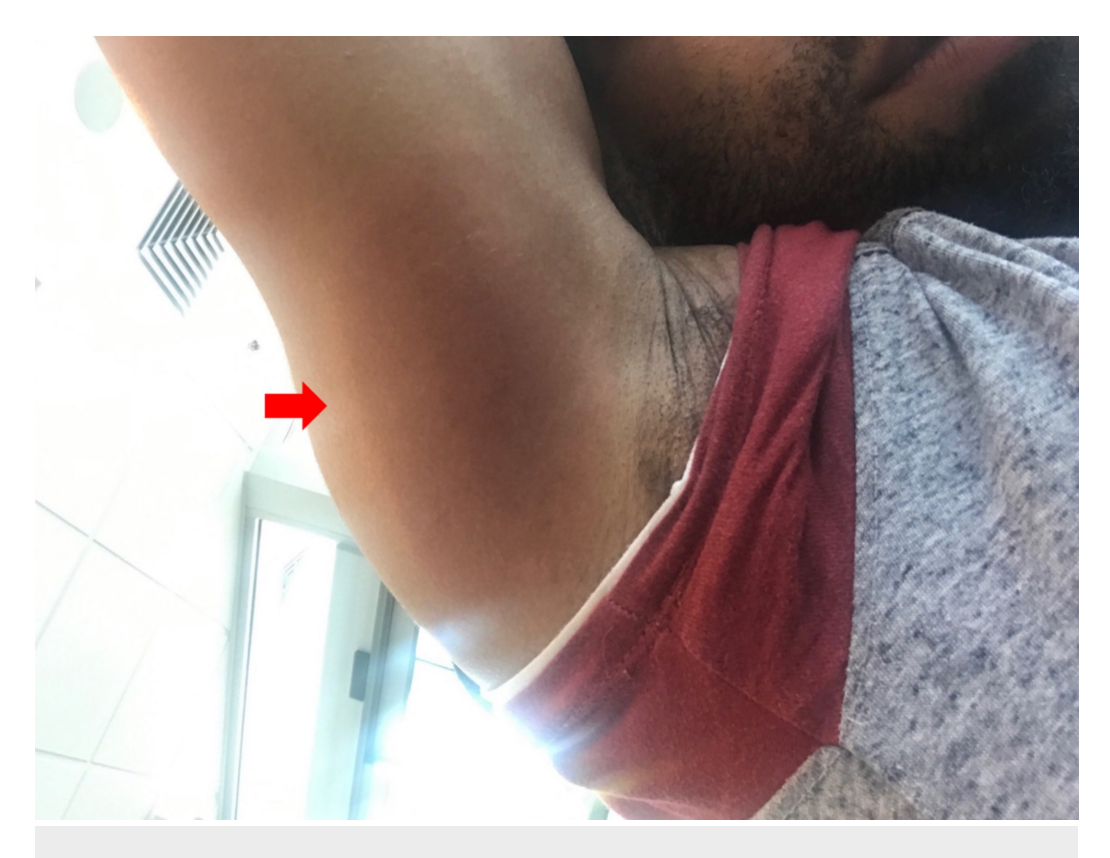
FIGURE 1: Erythema migrans (EM), right underarm

A 32-year-old African-American man initially presented for evaluation with a possible "bug bite" and an associated oval, red skin lesion on his posterior proximal arm, chills, and fatigue (Figure 1).