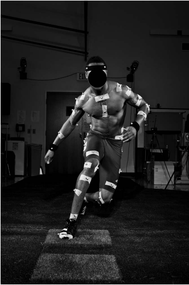
Figure 2. Exemplar cut maneuver performed by a wide receiver. The cut step occurred on a force plate.

representative kinematic cut and sidestep profile for each athlete.