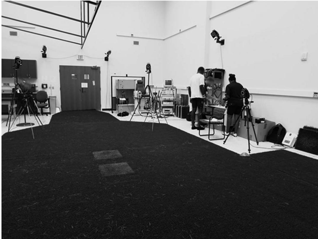
Figure 1. Motion capture laboratory outfitted with synthetic turf. Turf was secured to force plates and decoupled from surrounding turf.

an amendment. The study was approved by the appropriate health sciences and behavioral sciences institutional review board.