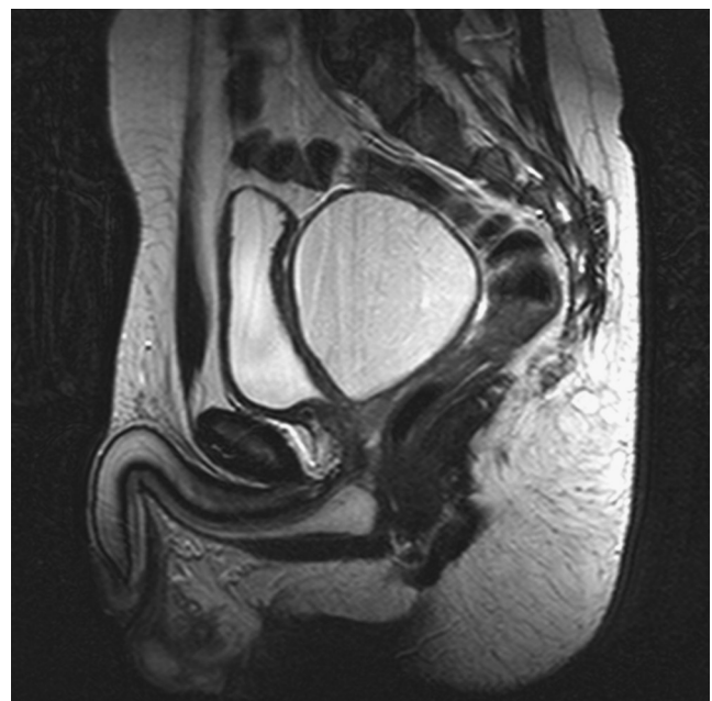
Figure 2 T2-weighted sequence of pelvic MRI showing seminal vesicle tumor measuring 87×85×75 mm.

value was 2.17 ng/mL basal and 3.93 ng/mL after glucagon stimulation. The study was completed with an abdominopelvic magnetic resonance, showing the following findings (Figs 1, 2 and 3): kidneys of a reduced size with multiple cysts of a maximum size of 1 cm, renal pelvis ectasy, reduced pancreatic volume, bilateral epididymal cysts and a mass of 87×85×75 mm in the seminal vesicle area.