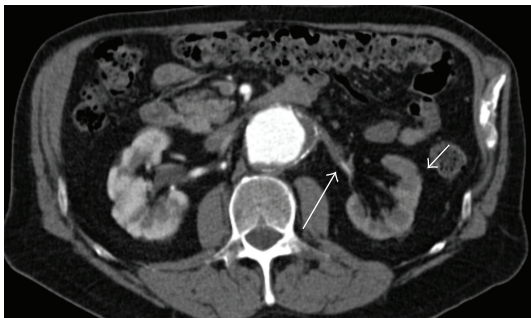
FIGURE 3: Preoperative CTA showing left kidney with preexistent occluded renal artery and contrast-enhancement in the cortical area (cortical rim sign, small arrow) with distal renal artery perfusion suggesting collateral (perirenal) flow (large arrow).

disease, extent and location of thrombus, presence of collateral vessels, and duration of anuria, have been described to predict whether successful restoration of renal function is likely [9, 11, 13]. Anuria time seems to be the best indicator for duration of ischemia and is reversely correlated with recovery of renal function [9].