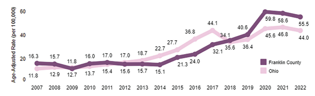
FIGURE 2. Rate of Franklin County resident deaths by year, 2007–2022. Data and figure are courtesy of Columbus and Franklin County Addiction Plan, 2023