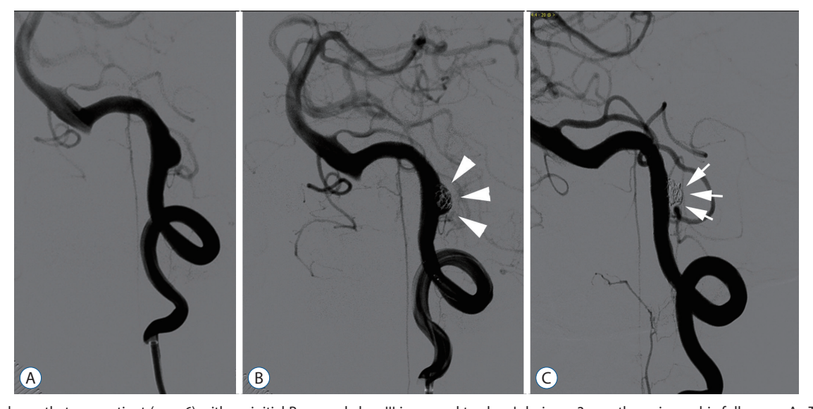
Fig. 2. It shows that one patient (case 6) with an initial Raymond class III improved to class I during a 3-month angiographic follow-up. A: The initial angiography showed the vertebral artery dissecting aneurysm. B: Angiography after the procedure showed the aneurysm sac filling (arrowheads). C: Angiography after 3 months elucidated that no contrast filled the aneurysm (arrows).

An angiographic follow-up at 3–9 months (mean, 5.7±1.6 months) showed (Table 1) complete occlusion in 15 cases (83.3%, Fig. 1). All patients elucidated successful occlusion (Raymond I and II) at last angiographic follow-up. Five cases (27.8%) were improved with progressive occlusion of the aneurysm (Fig. 2). One case (case 11) with a residual aneurysm sac at first angiographic follow-up 3 month postoperatively, and received another angiography at 9 months, which improved to Raymond class II. No decreased Raymond class was found. In the clinical follow-up period (mean, 21.3 months; range, 15–42 months), 17 patients (94.4%) had mRS scores of 0–2. The mRS of 16 patients (88.9%) improved and none were decreased. The MRA or CTA follow-up was conducted with clinical follow-up, which showed satisfied patency. No rebleeding occurred during the follow-up.