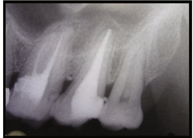
FIGURE 3: Post obturation IOPA.