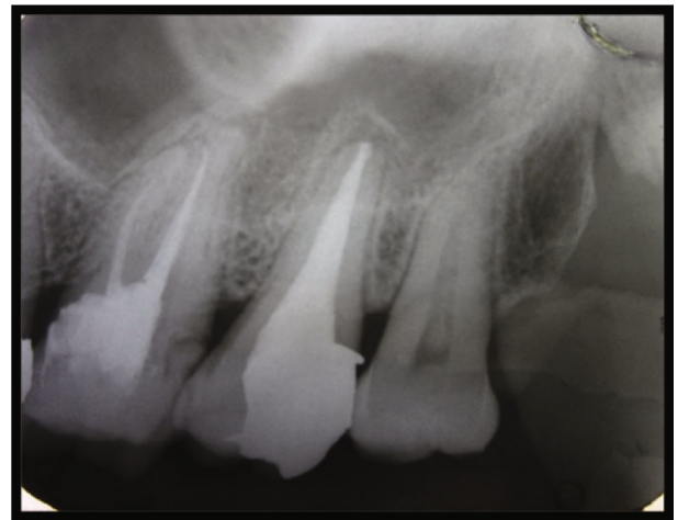
FIGURE 4: Final restoration IOPA.

AstraZeneca Pharma Ind Ltd., Bangalore, India.) followed by rubber dam isolation. Access opening with the aid of magnifying loupes (zumax 3.5X) of tooth 27 revealed a large single orifice and one single wide root buccolingually extending toward the root apex. Working length (WL) was determined with an apex locator (CanalPro Apex Locator, Coltene) and was confirmed with k-file (Figure 2). WL IOPA also confirmed the single-rooted maxillary second molar with a single canal. Root canal shaping was done with k-files using the conventional method of canal preparation and was irrigated with sodium hypochlorite (Sigma Aldrich, Germany). EDTA was used to remove the inorganic component of the root canal system, and a smear layer formed with filing the dentin. Saline was used as intermittent irrigation. Due to the wide nature of the canal, more attention was paid on chemical disinfection.