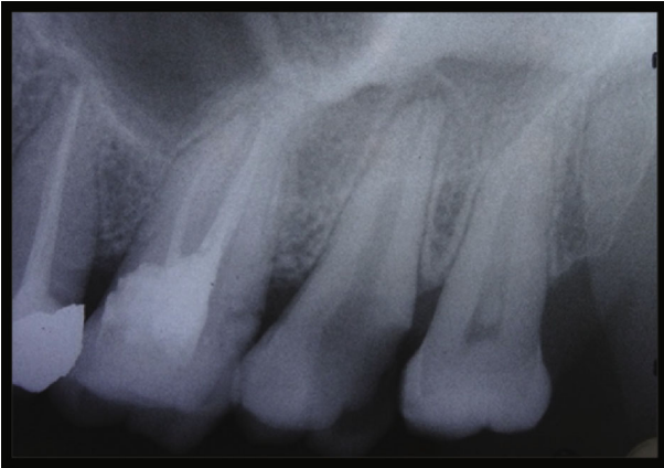
FIGURE 1: Preoperative IOPA.