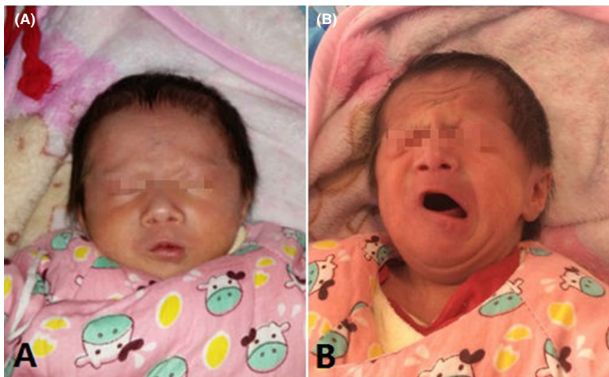
FIGURE 1 Photographs of the neonate while sleeping and during crying. A, No asymmetry of face while sleeping; B, Asymmetry of the face with deviation of the mouth towards the left when the neonate is crying. The lower right facial weakness is evident only during crying, when the lower lip is pulled towards the normal or functioning side

Due to the increasingly worsening condition, the infant was treated with nasal continuous positive airway pressure (NCPAP). Besides, a natural bovine surfactant with 100 mg/kg of phospholipids was given through an “endotracheal tube” to treat the respiratory distress syndrome (RDS) as manifested on the chest X-ray. Follow-up examination showed improvements in the saturations.