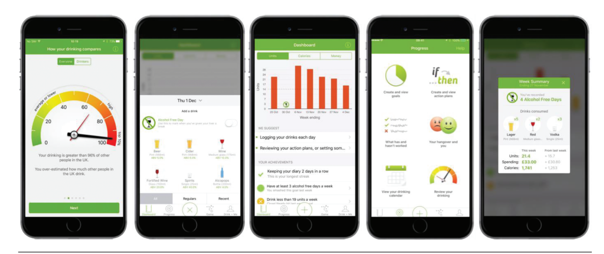
Fig 2 | Example screenshots from the Drink Less app.

The development resulted in an alcohol reduction smartphone app that was centered around a goal setting intervention module and had five