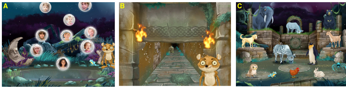
FIGURE 1 | Three paradigms suitable for an outcome measure for sleep dependent learning. (A) Target detection of emotional stimuli: a continuous performance task which uses children's faces as stimuli. Targets are smiling expressions and non-targets are neutral or sad expressions of emotion. Performance is evaluated through reaction time, intra-individual standard deviation of reaction time, commission and omission errors. (B) Spatial learning:

a 2D map is provided briefly for a 3D maze learning task. Performance is evaluated through number of decision points passed; total decision time; and navigation speed (number of decision points/total decision time). (C) Language learning: a set of animals is presented together with their names in an unfamiliar language. After a 12 min duration the unfamiliar animal names have to be recalled. Performance is evaluated through number of animals correctly recalled.