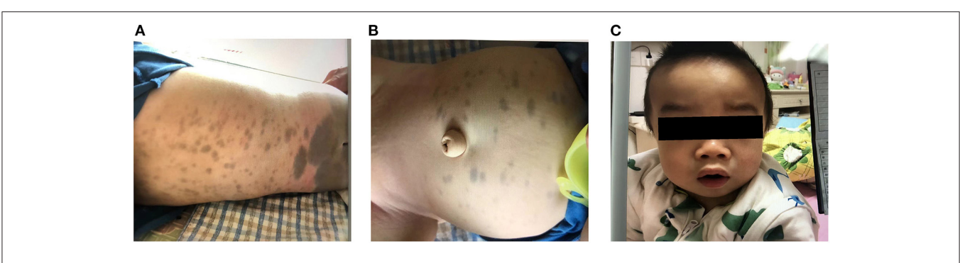
FIGURE 1 | (A,B) Large Mongolian spots observed on the abdomen and buttocks of the child. (C) The child has thick lips, collapsed nose bridge, nose facing the sky, and enlarged head circumference.