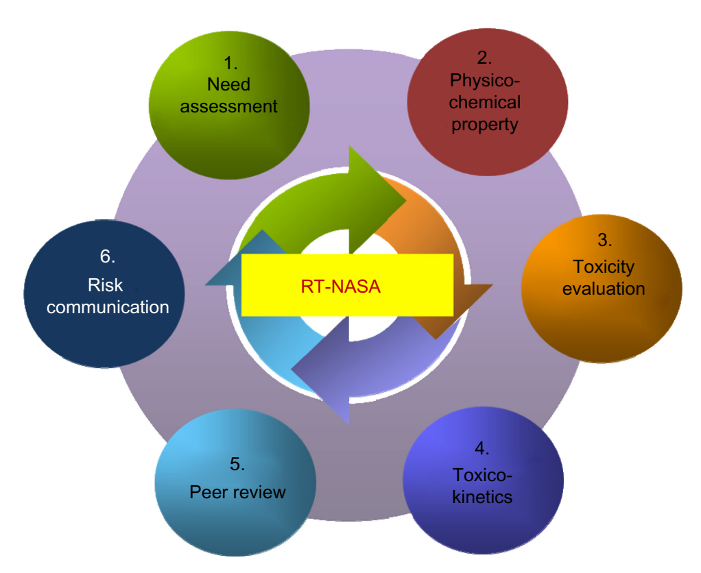
Figure 2 Six functional steps of the nanosafety process established by the Research Team for Nano-Associated Safety Assessment (RT-NASA).

In order to assess the level of consumer awareness, we analyzed their responses in addressing knowledge of and encounters with NPs, based on sex, age, level of education, and average monthly household income. Analyses of the results indicated no significant difference in the responses by sex, age, and level of education. However, significant differences in the responses were observed from average monthly household income. Moreover, when we compared the awareness of nanotechnology between consumers and experts, we found that consumers had a more positive attitude toward nanotechnology and its application although they had lower awareness of it than the expert group. Therefore, we suggest that a communication system, including educational and promotional programming, should be established to address consumer expectations and concerns.