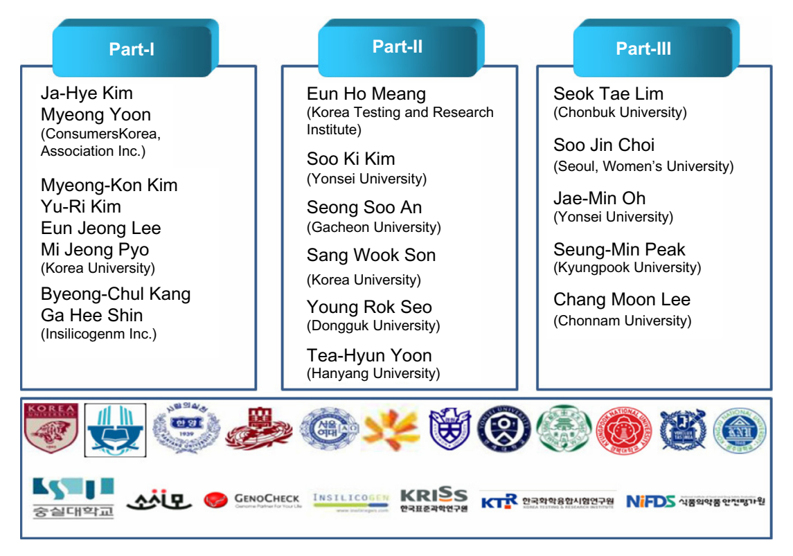
Figure 1 Structure of Research Team for Nano-Associated Safety Assessment.

Toxicokinetic studies of NPs were carried out in part III, which mainly focused on the absorption, distribution, metabolism, and excretion study of NPs from various exposure routes and physicochemical properties. New techniques and estimation methods for toxicokinetic analyses were developed in this study, with quantitative analysis for nanotoxicity.