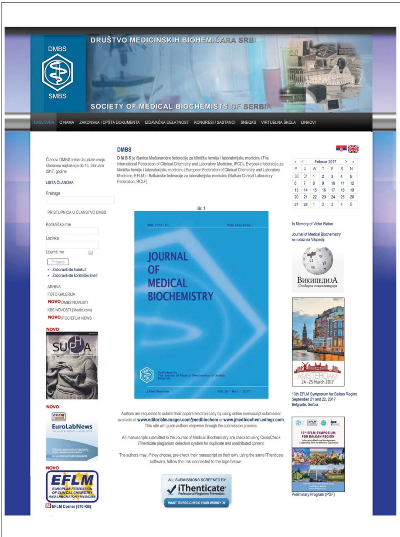
Figure 2 Cover page of the Society Medical Biochemits website (www.dmbj.org.rs)