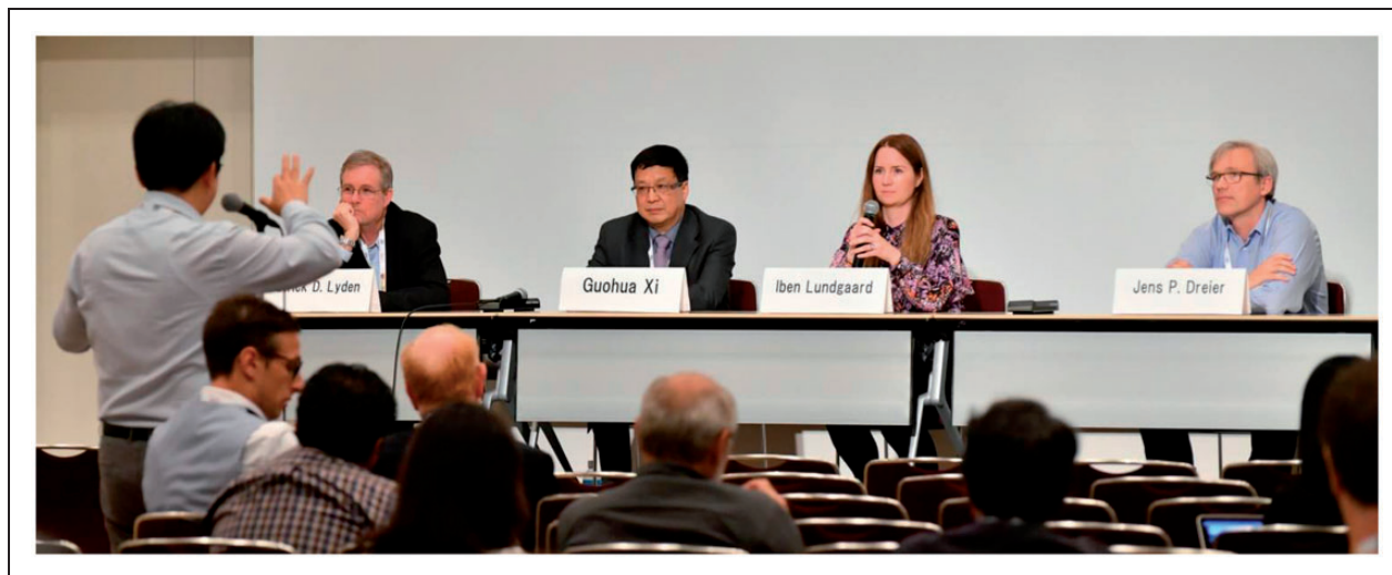
Figure 1. Active discussion between the audience and the invited speakers in the JCBFM Symposium.

damage in patients with different types of acute brain injury.