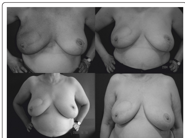
Figure 3 Appearance of the patient at different times, while the radiotherapy was delivered and, three months, two years and five years after the end of radiotherapy.