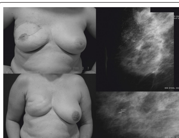
Figure 1 Appearance of the patient who suffered from an ipsilateral breast cancer recurrence, she underwent a skin-sparing mastectomy and immediate breast reconstruction with an adjustable breast implant. She did not want undergo a reduction mammoplasty for simmetrization. Mammography showed a small group of microcalcifications; the core biopsy confirmed an in situ ductal carcinoma.

We were able to interview and evaluate 23 patients cosmetically, the reasons for this being: three patients died, one had an ipsilateral recurrence and was mastectomized, three had a distant recurrence and were in a bad state, one was diagnosed and treated for contralateral breast cancer and one had a surgical procedure on the affected breast, while the rest refused to participate