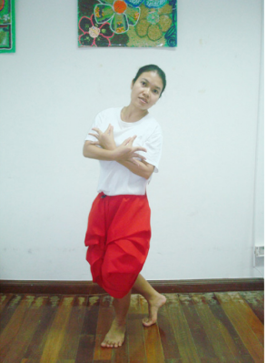
Figure 2 Type of traditional Thai dance.