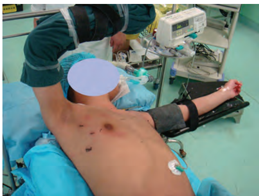
Figure 2 - Intraoperative patient position.

First, a 10-mm incision was made in the seventh intercostal space at the midaxillary line of the selected side for the placement of a 30° thoracoscope. Two 15-mm incisions were made: one in the third intercostal space at the anterior axillary line and one in the fourth or fifth intercostal space at the anterior axillary line. With the control of contralateral lung inflation, the entire thoracic cavity on the operation side was examined carefully, and the lung bullae found were resected using an endostapler (Echelon 60 Endopath stapler; Ethicon Endosurgery Corp., Cincinnati, OH, USA). The mediastinal pleura was then opened between the sternum and the pericardium with an electric separating hook, and an 8-to-10-cm incision was made into the pleura under the sternum (Figure 3A). Selective deflation of the contralateral lung and appropriate inflation of the lung on the side of the operation were carried out without complication. The 30° thoracoscope and long grasping forceps were inserted into the contralateral thoracic cavity from the mediastinal pleura incision (Figure 3B).