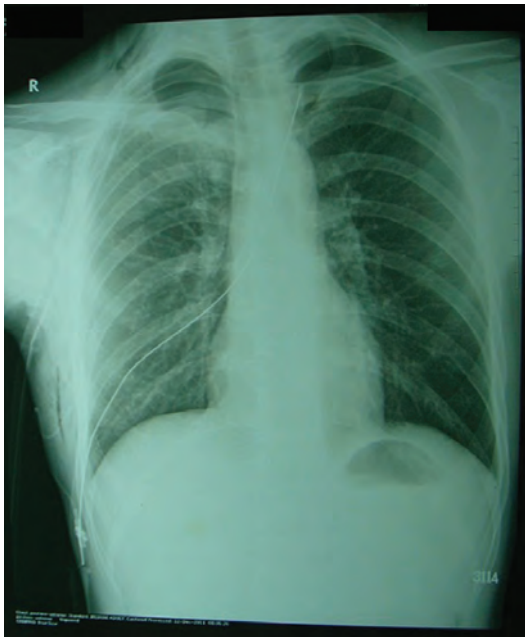
Figure 4 – Postoperative chest X-ray showing the chest tube inserted through the mediastinal incision to the contralateral thoracic cavity.

a longer surgical time, (4,10) which can increase the risk of intraoperative complications.