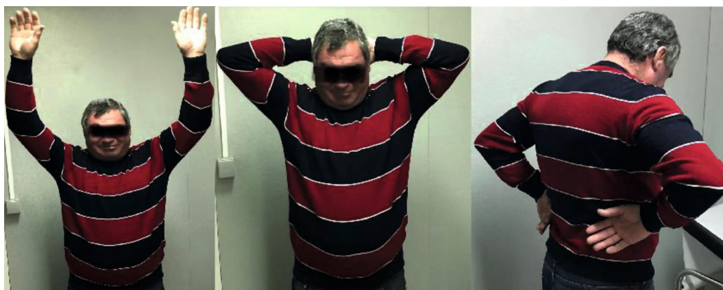
FIGURE 2: Functional outcomes three years after shoulder pyrocarbon hemiarthroplasty.