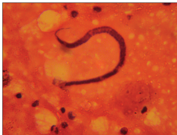
Figure 2: Medium power view showing microfilaria of Wucherera bancrofti with clear space free of nuclei at the caudal end. A polymorphic inflammatory infiltrate (including eosinophils) is seen in the background (x100)