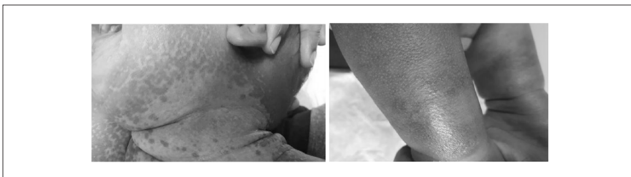
Figure 2. Dramatically cleared eczema herpeticum with denuded skin on arms and neck after initial 7 days of intravenous acyclovir followed by 10 days of daily prophylactic oral acyclovir. Characteristic healing pink and hypopigmented macules have replaced previous erosions.

infection. She was admitted to the pediatric unit due to severity of symptoms and malaise.