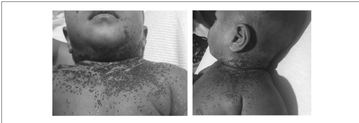
Figure 1. A child with atopic dermatitis complicated by eczema herpeticum on the anterior chest, neck, and face. Characteristic monomorphic punched-out lesions coalescing into areas of denudation.