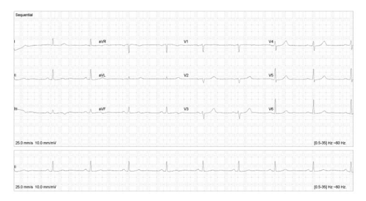
Figure 1. Normal electrocardiogram at the primary care office.

Then, a coronary angiogram was done and showed an anomalous Right Coronary Artery (RCA) originating from the left coronary sinus of Valsalva (Figure 2). There was no evidence of any obstructive atherosclerotic coronary artery disease. A computed tomography scan was subsequently obtained, confirming this diagnosis with a large proximal right coronary artery, with an intramural course between the pulmonary artery and aorta. The patient was referred for a surgical intervention. A vein graft was bypassed to a 1.5 mm patent ductus arteriosus, which had flows of 110 cc per minute. The patient tolerated the procedure well. He was started and discharged on aspirin, statin, and beta-blocker.