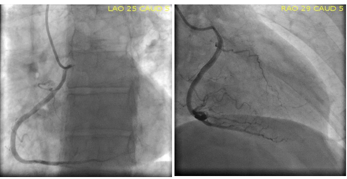
Figure 2. Coronary angiography revealed the anomalous right coronary artery from the left sinus of Valsalva.