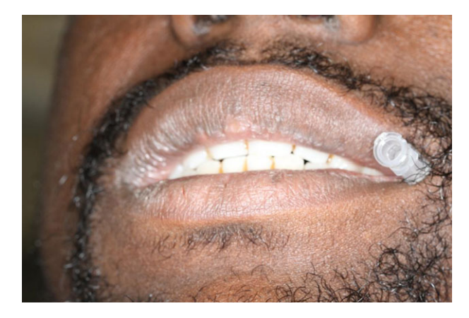
Figure 3: Picture showing the catheter portal accessibility for regular delivery of plain bupivacaine.

catheter. The catheter is inserted to enable the repeated delivery of long acting local anaesthetic such as bupivicaine to the Inferior dental nerve. The catheter, allows re-administration of analgesia in a quick, effective and non-invasive manner.