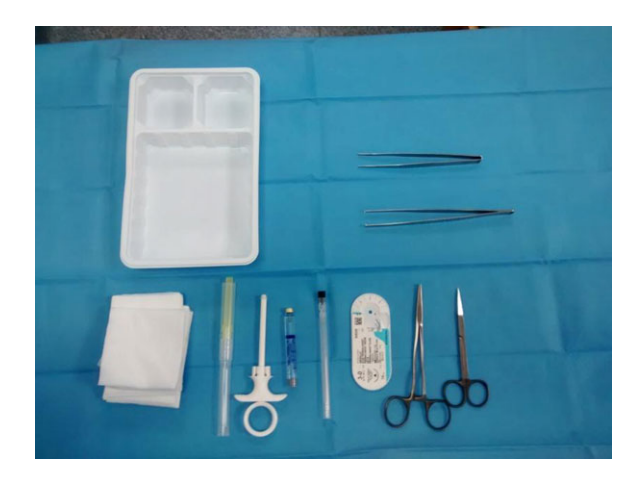
Figure 1: Equipment required for procedure.

Treatment and management is with preventative medication such as Danazol, and acute flares are treated with C1-INH.