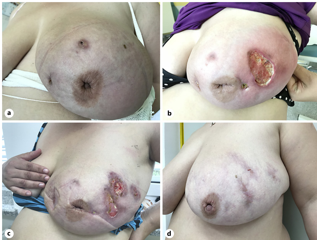
Fig. 1. a Painful nodules and fistulas with purulent secretion on the left breast with chronic nipple retraction. b Development of a painful ulceration nearby the incisional biopsy (possible pathergy phenomenon). c Appearance of new subcutaneous nodules, abscesses, and ulcers during treatment with doxycycline, methylprednisolone, and mycophenolate mofetil. d Prompt and complete healing of the breast ulcers and resolution of abscesses and nodules after treatment with adalimumab.