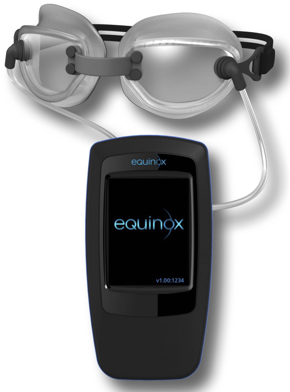
Figure 1 Multi-pressure dial, which includes the goggles connected to a handheld pressure-modulating pump. This device was worn for the duration of the 8-hr study period in this study.

The short-term safety of the MPD has been established with key safety parameters remaining unchanged after a 30-min wear in a prior study by Thompson et al. 4 The goal of this study is to evaluate safety and tolerability of the MPD for an extended, uninterrupted duration (8 hrs).