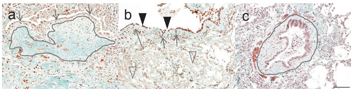
Figure 2 Characteristic tissue niche in chronic airway diseases. Panel (a) shows a histological section from a patient with IPF, characterized by a fibroblastic foci (outlined area) located below the epithelial layer (arrows). The fibroblastic foci is an area rich in ECM but with only few cells with a stretched morphology, located in parallel to the alveolar septa cells. Panel (b) shows a histological section from a patient with asthma, characterized by thickening of the basement membrane (arrows), shedding of the epithelial layer (closed arrowheads) and formation of peribronchial fibrosis (open arrowheads). Panel (c) shows a partially obliterated bronchiole (outlined area) in a patient with OB after lung transplantation. OB is histologically identified as ECM plugs with few fibroblasts. Original magnification 20 \times . Scale bar = 100 \mu m.

The above mentioned disorders are chronic diseases that involve remodelling of both the airways and the pulmonary vessels. The remodelling processes have many differences, but, surprisingly, also many similarities even though the underlying pathophysiological mechanisms are different. Remodelling usually starts with an epithelial injury that later gives rise to structural changes in the airways and in the lung. The origins of these disorders are different, but they have a common denominator – the ECM deposition changes the lung