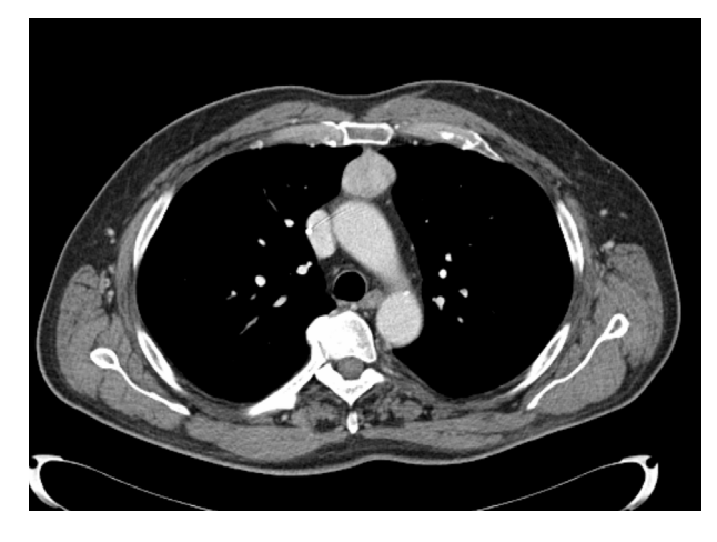
Figure 5 Chest CT scan (mediastinal window) showing small middle-mediastinal thymoma. Abbreviation: CT, computed tomography.

of an increased risk of pleural dissemination.<sup>30</sup> The no-touch technique requires a more complex and accurate dissection, and thus a longer learning curve and longer operative time.<sup>16</sup>