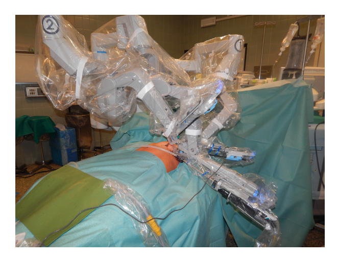
Figure 3 Patient-side cart with robotic arms introduced through the ports.