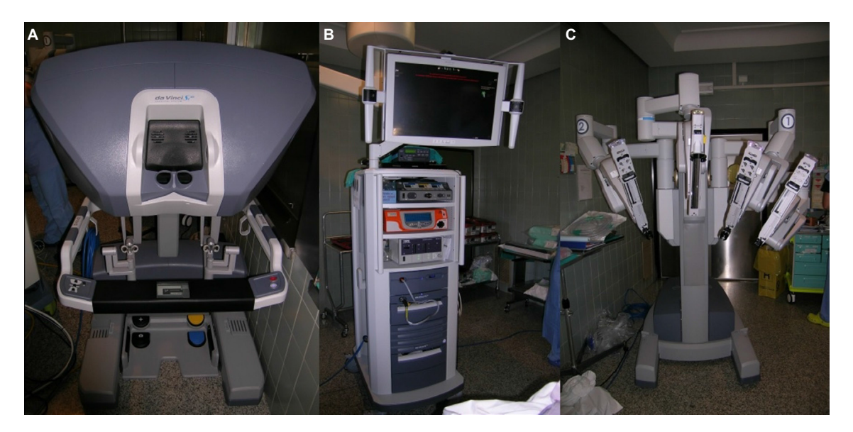
Figure I Robotic components. Note: (A) surgeon's console, (B) vision system, and (C) patient-side cart with robotic arms.

Notes: ( A ) Patient positioned left-side up at a 30^{\circ} angle. ( B ) Ports introduced on the fifth intercostal space on the midaxillary line, fifth intercostal space on the midclavicular space, and third intercostal space on the midaxillary region.