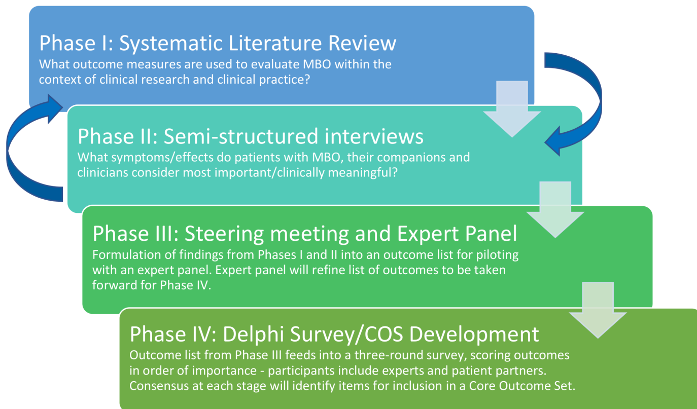
Figure 1 Process for the development of a core outcome set (COS) for malignant bowel obstruction (MBO).

represent lay stakeholders in the study management group advising on recruitment and participant-facing documentation. They will also contribute to thematic analysis of the interview data. Lay representatives will also be involved in the interpretation and dissemination of the study results.