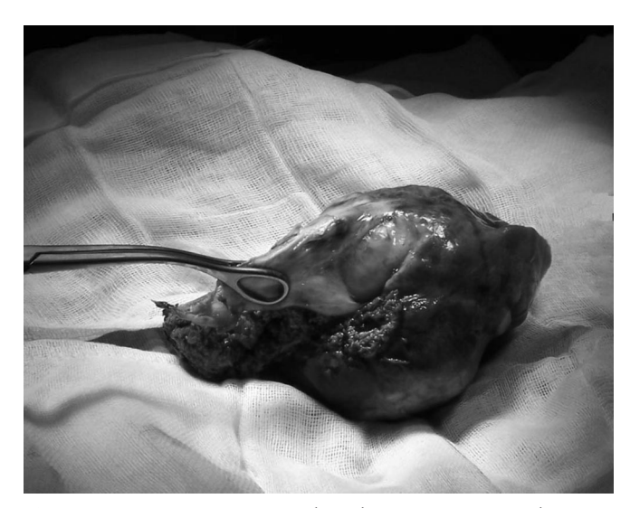
Figure 3. Liver specimen revealing the 8-cm metastatic lesion in left hepatic lobe.

Total operative time was 455 minutes with negligible intraoperative blood loss. Oral feeding was resumed on postoperative day 4. There were no postoperative complications, except for a prolonged serosal output from the abdominal drainage. The postoperative hospital stay was 12 days.