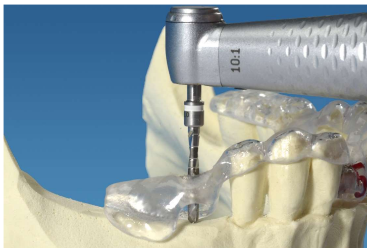
Figure 1. Orientation template fixed on the mandibular model. The pilot cavity in the region of tooth 45 was performed with a 2.0 mm pilot drill.

manufactured. Next, an X-ray splint was produced by thermoforming using a plastic sheet (Erkodur 1.5 mm; Erkodent GmbH, Pfalzgrafenweiler, Germany) fused to a refFIX™ disk containing three titanium pins of 2 mm diameter (RefPin, IVS Solution AG, Chemnitz, Germany). A cone-beam computed tomography (CBCT, Accuitomo, J. Morita Corporation, Osaka, Japan) was performed with the X-ray splint fixed onto the mandible model. The following parameters were applied: tube voltage, 60.0 kV; current, 3 mA; exposure time, 17.5 s; gantry angle, 0.0°; field of view, 80 × 80 × 80 mm; and voxel size, 0.160 mm. The obtained data was transferred into Digital Imaging and Communications in Medicine (DICOM) files and imported to the three-dimensional planning software, coDiagnostiX™ (Dental Wings, Chemnitz, Germany). The implants were then positioned according to clinical guidelines considering the bone height, bone width, distance, and angulation of the adjacent teeth and, in the premolar region, the distance to the mental foramen. Based on the data, five surgical orientation templates containing a sleeve for the pilot drill each in the region of tooth 41 and tooth 45 were manufactured using the gonyX® device (Institute Straumann AG, Basel, Switzerland). The sleeves (3D Diagnostix Incorporation, Boston, MA, USA) had an inner diameter of 2.0 mm and an outer diameter of 3.0 mm, and were 4.0 mm in length. The mandibular model with the fixed orientation template is shown in Figure 1.