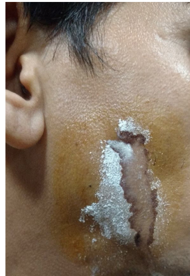
Figure 2 After sprinkling with starch flour and giving sialogogue, the site of salivary leak is seen.

tically, anterior to the round window niche. Also, apart from the anterior and posterior branch, the nerve can have a hypotympanic branch or more branches. 3 These branches lie in a groove and are either covered by mucosa only or lie in a bony canal. 2 Endoscopy has opened up new avenues to approach this nerve as the endoscope helps in precise identification of branches of the nerve. 4