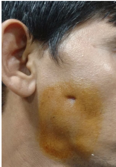
Figure 1 The fistula site painted with betadine.