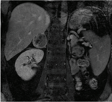
FIGURE 1: Preoperative magnetic resonance imaging (MRI) of right peri-adrenal tumor.