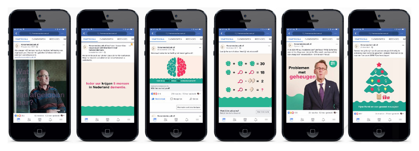
FIGURE 2 Facebook advertisement campaign for participant recruitment, including (from left to right) awareness video, brain fact pinned posts, brain quizzes, puzzles, one-minute academy videos, and weekly free posts