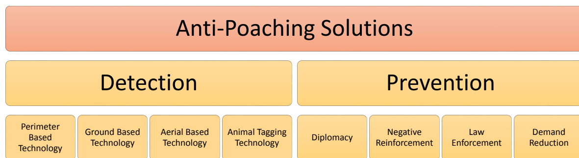
Figure 3. Anti-poaching methodology.

There is not a lot of literature available that focuses specifically on anti-poacher solutions. Therefore, we included material from research proposals, conservation websites, government websites, and news articles. The literature was categorized in two anti-poaching approaches, prevention and detection. The methodology of this paper is shown in Figure 3. Methods against poaching can be divided into prevention and detection of poaching. Although this survey primarily focuses on detection technologies, we will give a brief overview of the prevention of poaching.