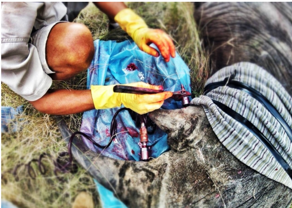
Figure 5. A snapshot of dyeing and removal of the rhino's horn in an attempt to stop poaching. The horn is poisoned with chemical to make the horn useless to consume [98].

In an attempt to discourage poachers, the horns of live rhinos have been injected with pink dye and poisonous chemicals to render the horn unusable. As shown in Figure 5, the intoxication process is done by drilling a hole directly into the horn. The chemical should easily be detected at airport check points during transportation to make it difficult to illegally transport the horns. The poison can seriously hurt the health of unknowing end-users. Moreover, in a recent study, Ferreira et al. [97] refute claims that dyeing horns is effective. Among other arguments against this method, their most important finding is that the dye does not permeate in the high-density fibre of rhino horn. The dye remains in the drilling hole so that the horns can easily be cleaned and traded.