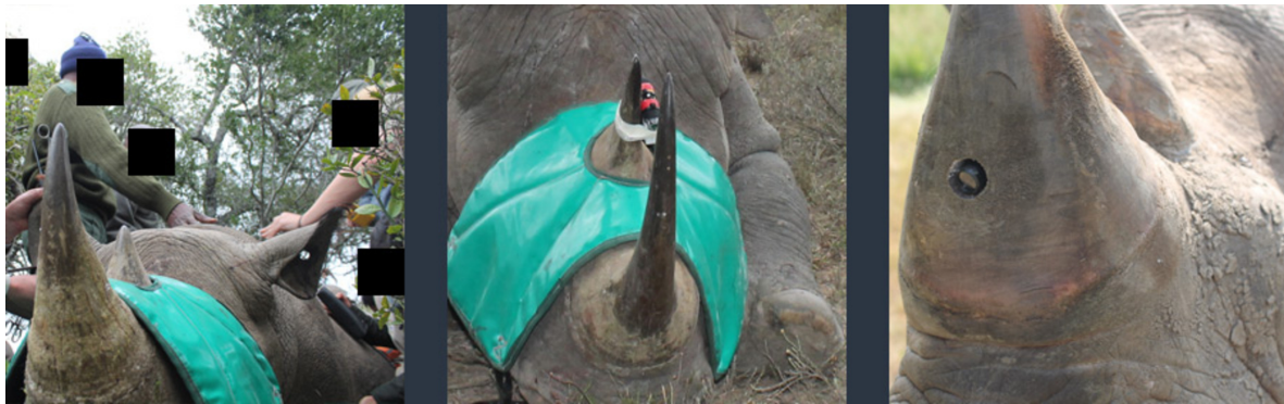
Figure 4. The camera component implanted in the front lobe of the rhino's horn [34].

An alternative collar based solution is proposed by Intel (Santa Clara, CA, USA), as a contribution to a conservation effort in the Madikwe Conservation Project [73]. A kevlar-based ankle collar was attached to the rhino's ankle during a pilot project with five black rhinos. The collar contains Intel's Galileo board that is used to track the rhino's location and can communicate through a 3G connection. A durable solar panel is attached to the collar to recharge the batteries. A RFID chip was placed inside the rhino's horn. When the RFID chip is out of reach of the Galileo board, an alarm is triggered and APTs are alerted via the 3G connection. They can then rush to the scene with helicopters, drones or other vehicles. This approach requires tranquilizing the rhino to attach, repair or remove the collar, and, each time, the RFID grows out of the horn. This system is only helpful to try and catch the poachers. It does not save the rhino from being shot directly. It can be argued that the improved poaching detection causes more fear of being captured and will eventually stop more poachers from any poaching activity.