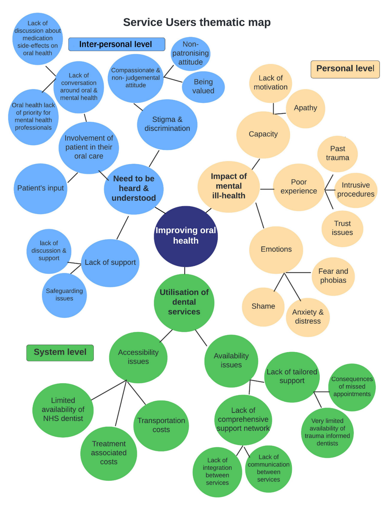
Figure 1. Thematic map of service users' perspectives on barriers to improving oral health in people with severe mental illness at personal, inter-personal and system levels.