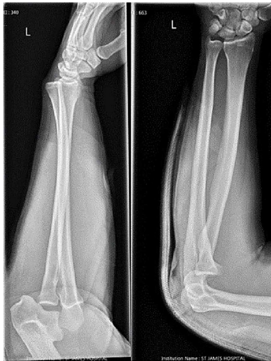
FIGURE 1: Images taken in ED on presentation.

On Day 1 postadmission the patient started to complain of increasing pain, and his elbow was found to have re-dislocated while being in the backslab. At this stage he underwent closed reduction with the aid of a full general anesthetic and muscle relaxant, as well as an examination under anesthesia (EUA). During EUA the elbow was found to be highly unstable and dislocated if extended past 100 degrees. The elbow was very unstable on valgus stressing, with no firm end point of medial collateral ligaments. The patient was placed in an above elbow cast, flexed to 80 degrees, until further imaging could be carried out.