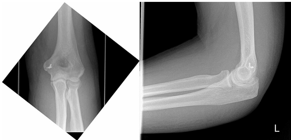
FIGURE 4: AP and lateral radiographs of elbow postoperatively demonstrating the position of suture anchors.

The incarcerated joint capsule was excised. The UCL and common flexor origin were repaired with suture anchors. Figure 4 shows the position of these anchors on postoperative X-ray. The ulnar nerve was stable through range of movement and so was not transposed. Postoperatively the patient was placed in an above elbow backslab for two weeks. After this he was allowed to mobilize freely and engaged in an intensive physiotherapy program. He has had no further episodes of instability and has returned to a full range of movement (Figure 5).