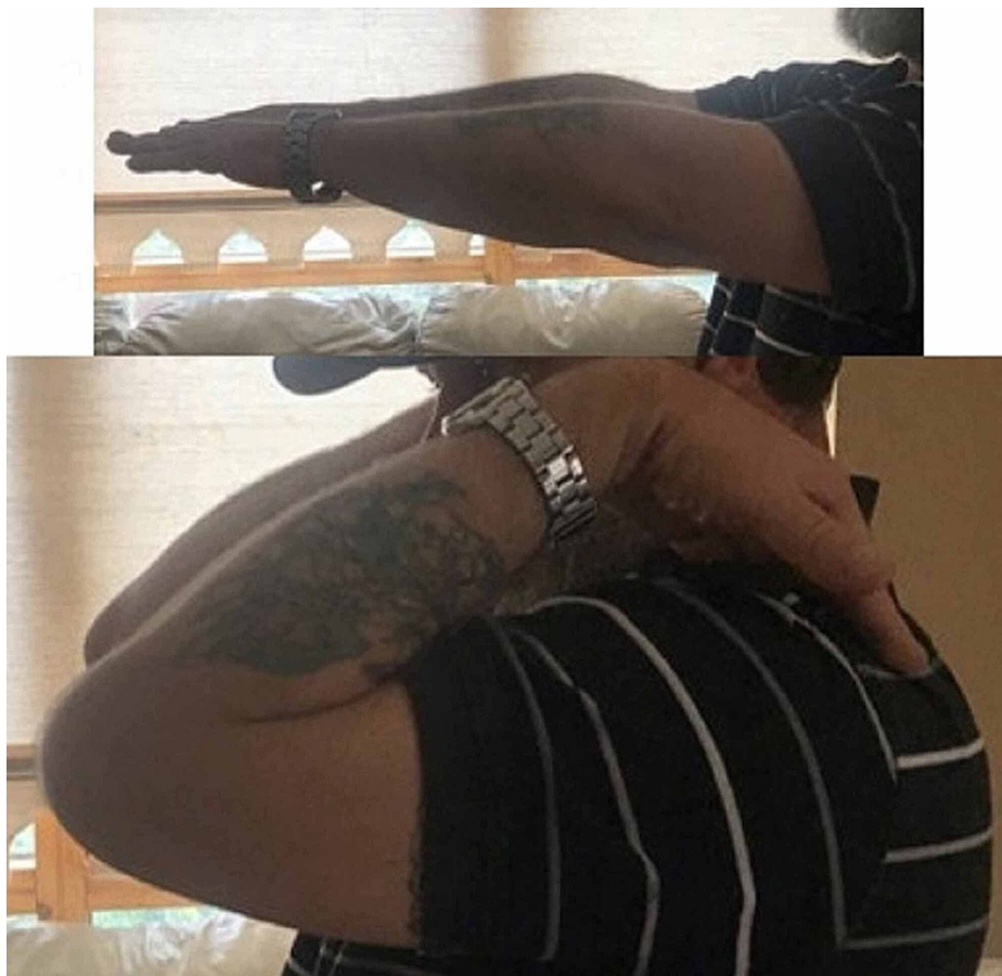
FIGURE 5: Photographs sent in by the patient, demonstrating his range of movement.