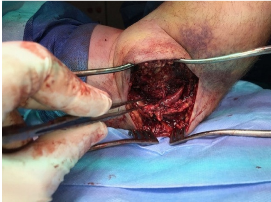
FIGURE 3: Bruising and edema observed around the ulnar nerve.

A medial (flexor carpi ulnaris splitting) approach to the elbow was carried out. The intraoperative findings were as follows: 1) complete avulsion of the common flexor origin, 2) complete avulsion of the ulnar collateral ligaments (UCL) from the medial epicondyle, 3) incarceration of the anterior joint capsule between the trochlea and the ulna, and 4) extensive bruising and edema of the ulnar nerve (Figure 3).