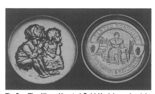
Fig 3. The Ulster Hospital Gold Medal: on the right the first medal awarded (1884 – 1897) and on the left the new medal introduced in 1922.