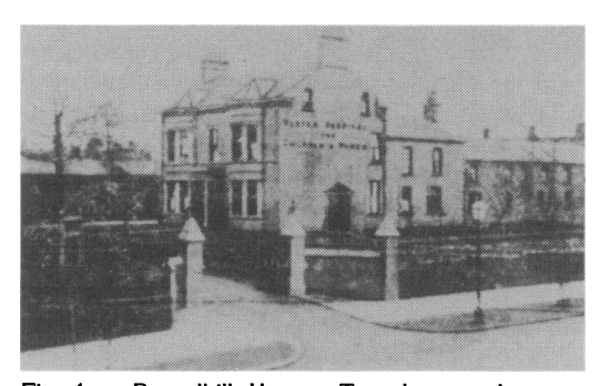
Fig 4. Roundhill House, Templemore Avenue, Mountpottinger.

Annual Report for 1890 and 1891 do not explicitly outline the reasons. Similarly, the Medical Staff minutes record only some vague discussion at the April 1891 meeting, but at a special meeting held in May, rooms were allocated in Roundhill House, Templemore Avenue, Mountpottinger (Fig 4), the new premises chosen for the hospital. The Medical Staff meeting held on 20 October 1891 was in Fisherwick Place: the next was held in College Square on 17 November, and the December meeting took