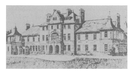
Fig 5. The new hospital in Templemore Avenue, 1912.

Exactly 12 months after the foundation-stone was laid, the new buildings