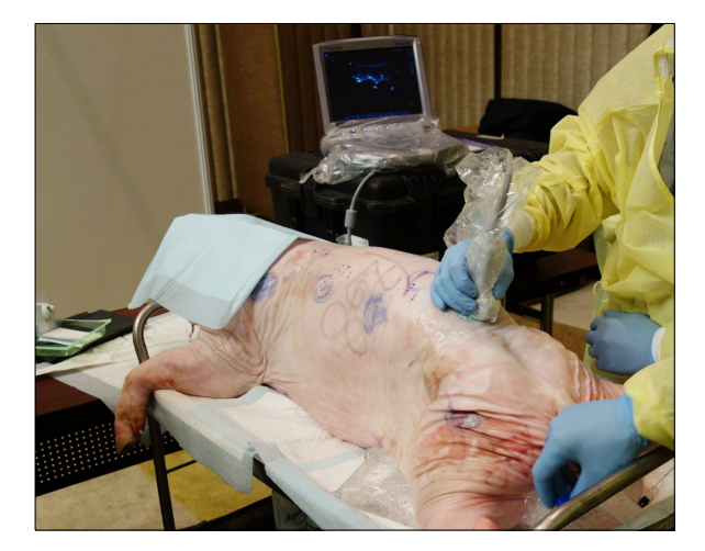
Fig. 3. A pig carcass used in an ultrasound workshop.

A meat phantom is moderately cheap compared with the Blue phantom. Since it has anatomic structures, it gives some tactile needle feedback, and the echogenicity of the background mimics human tissue. Practice of needle guid-