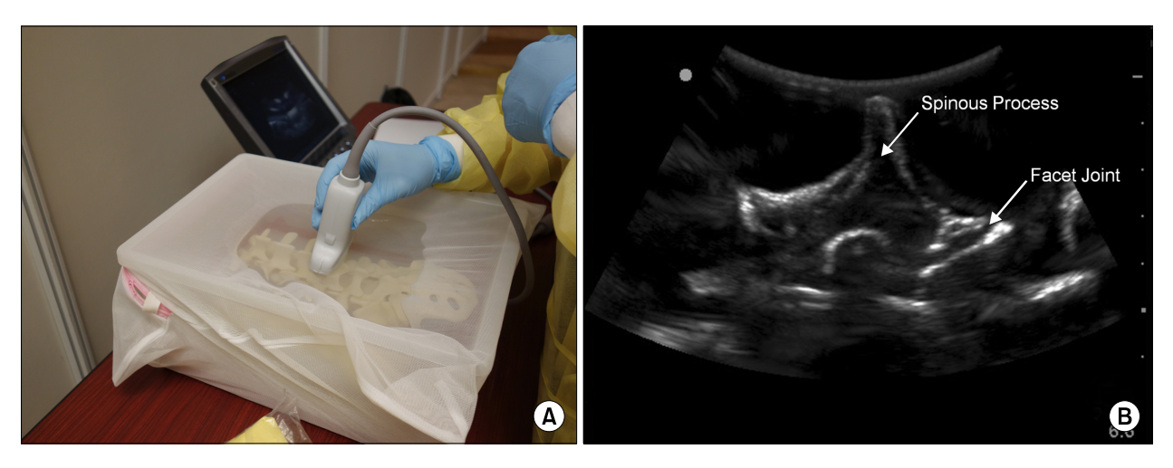
Fig. 1. Water phantom. (A) A lumbosacral spine model submerged in water and covered with a mesh to simulate human skin. (B) An ultrasound image of lumbosacral spine model submerged in water. The background echogenicity is close to zero.

\uparrow : hyperechogenic, \downarrow : hypoechogenic, +: lowest grade, +++: highest grade, NA: not applicable.